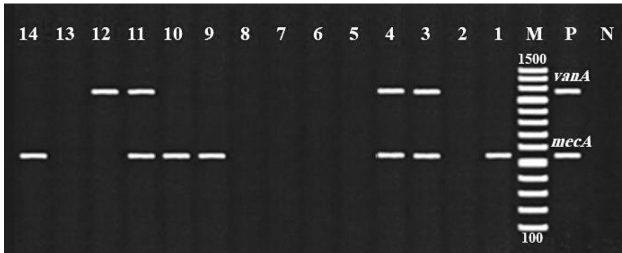
Figure 1: Molecular detection of antibiotic resistance genes ( mecA and vanA ) among S. aureus pathogens isolated from different samples in farm A. mecA gene: 533 bp, vanA gene: 1030 bp, Lanes 1-6: Cows' isolates, Lane 7: Milking equipment's isolates, Lanes 8-10: Barns' isolates, Lanes 11-14: Workers' isolates, M: 100 bp DNA marker, P: Positive control, and N: Negative control