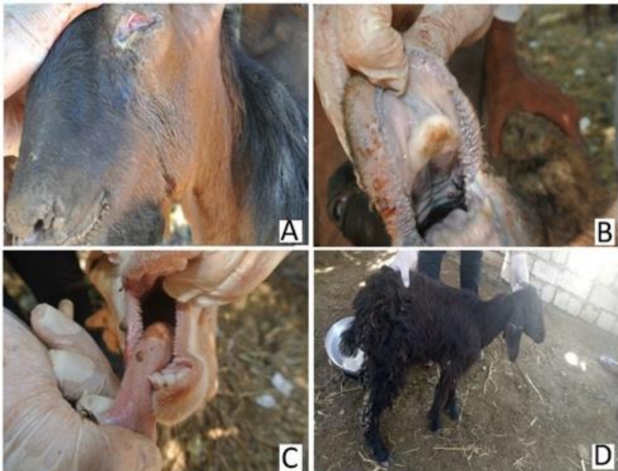
Figure 1: Diseased animals showed (A) Mucopurulent ocular discharge. (B) Erosion and diphtheritic membrane of hard palate. (C) Necrotic tissue and ulceration of tongue. (D) Soiling of hind quarters revealing profuse watery diarrhea