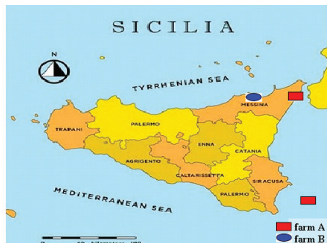
Figure 1: Map of Sicily

Non endemic goitre area = farm A Endemic goitre area = farm B