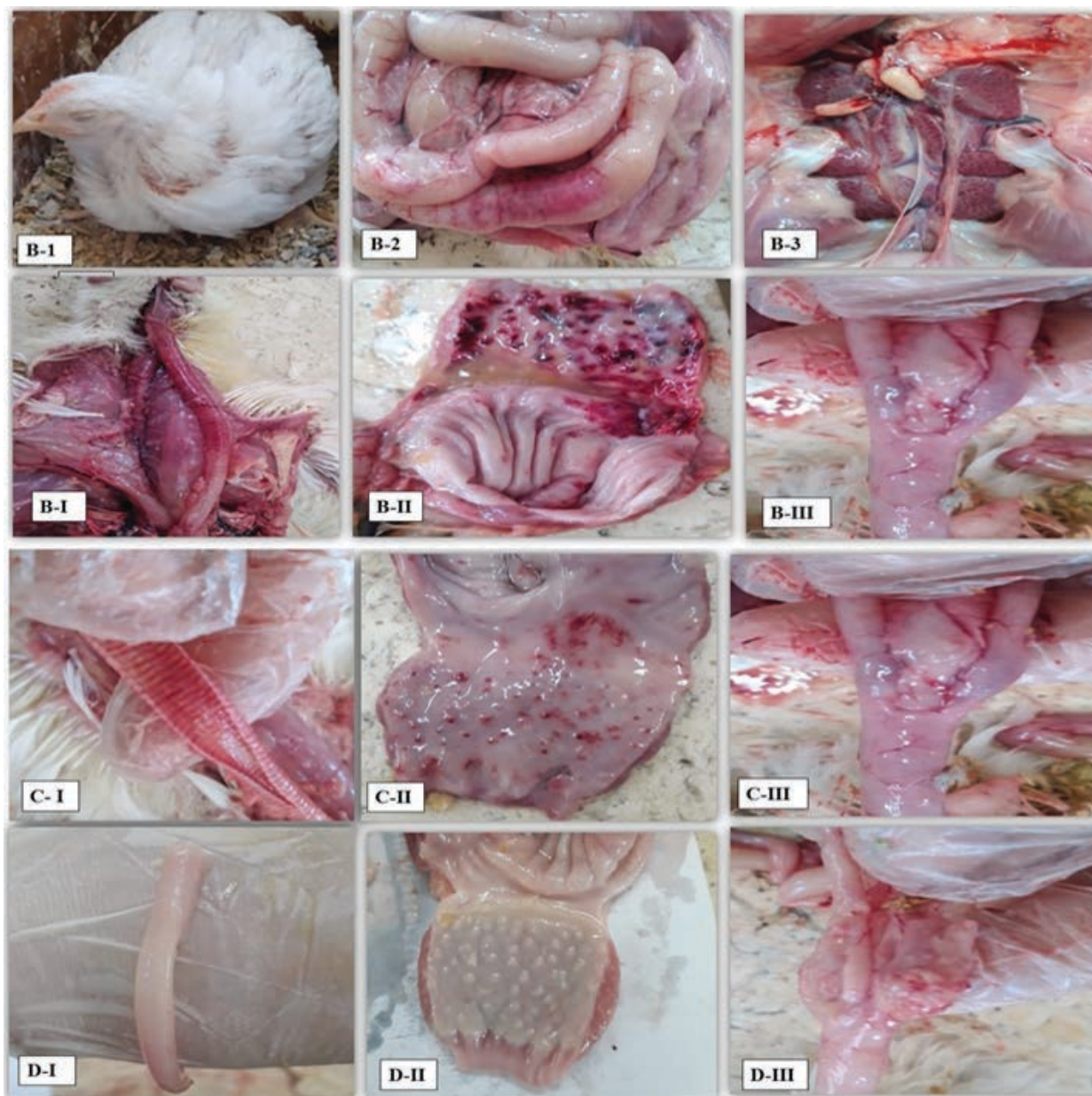
Figure 1: Clinicopathological picture of positive control group showing morbid bird with ruffled feathers, conjunctivitis, and nasal discharge (B-1); hemorrhagic ulcers along the intestine of dead bird (B-2) with inflamed kidneys (B-3). Moreover, several pathological lesions with varied scores were observed in the examined trachea (I), proventriculus (II), and cecal tonsils (III) of the experimental groups (B, C, and D) on day 7 post challenge with NDv

to note of focal deciliated areas. Significant differences in the histological tracheal alterations score were evident between the treated groups C and D and the infected untreated group B. Similarly, treated group C and D proventricular (P) sections showed slight edema, congestion, and mild lymphocytic infiltration which significantly improved histological score when compared with group B (positive control sections) that showed severe mononuclear cell infiltration with severe hemorrhages and necrosis, loss of the lining epithelium, fusion, and shortening of the plicae.