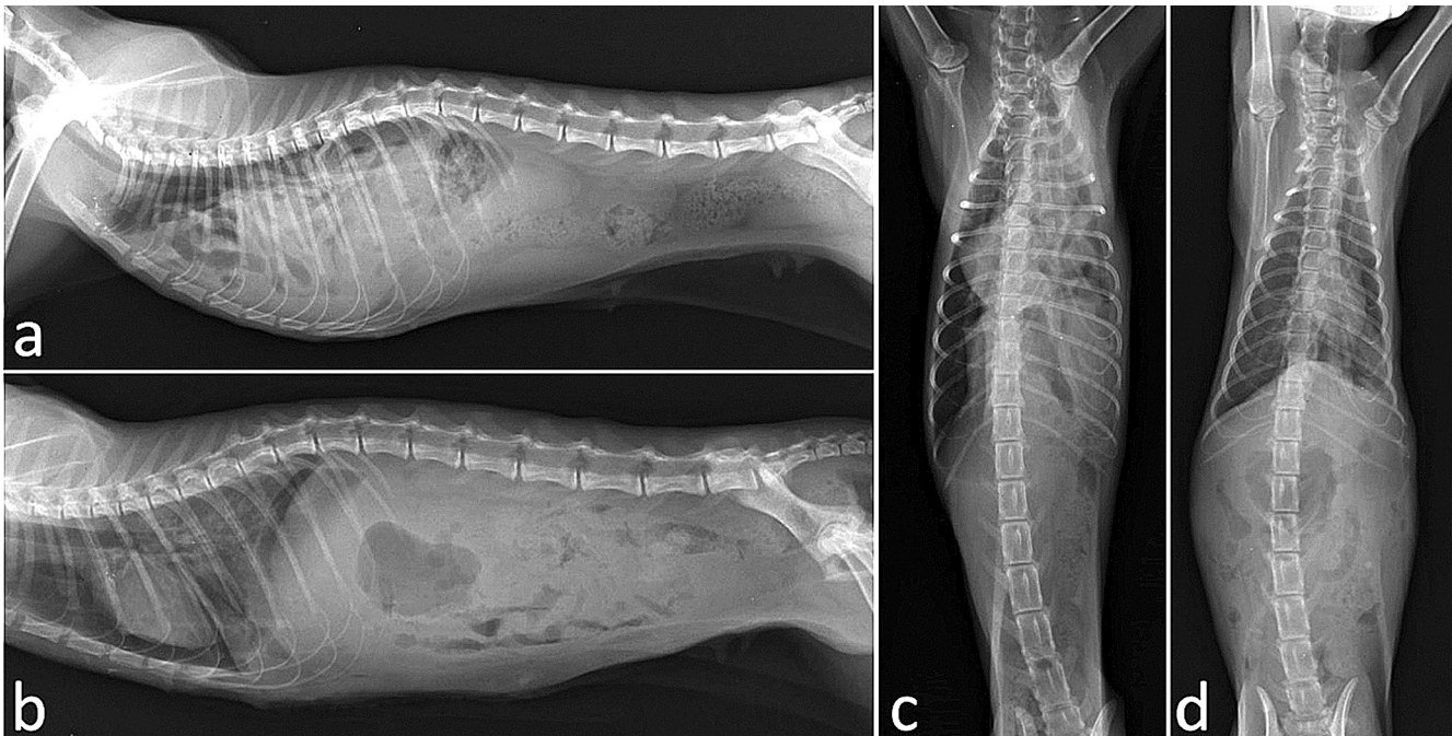
Figure 2: Plain radiographic images of a cat with a diaphragmatic hernia. Preoperative (a, c) and postoperative (b, d) images show the abdominal organs filled in the thorax before surgery, and in their normal position postoperatively